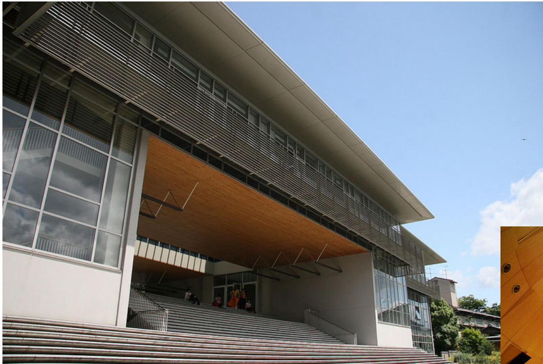
Centennial Hall (International Student Center)