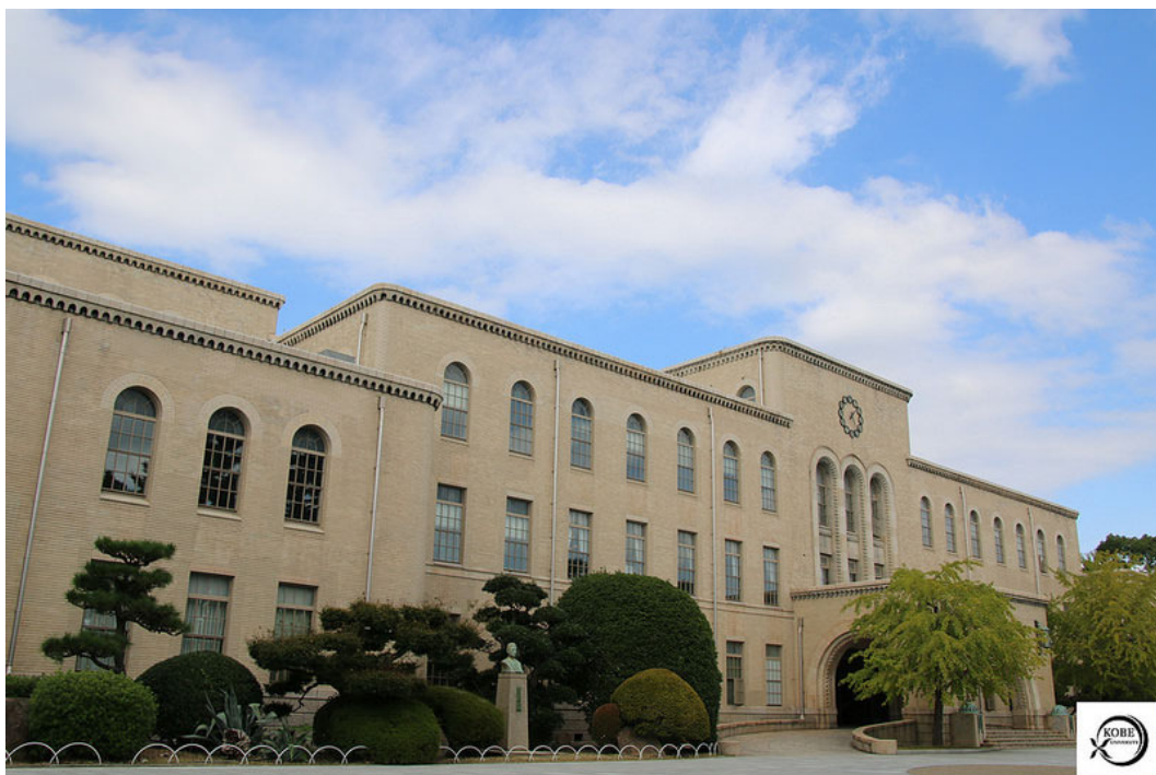
University Main Building