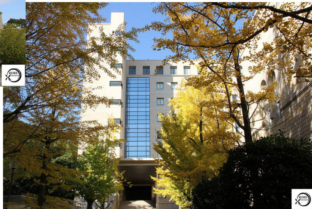
Frontier Hall & Library