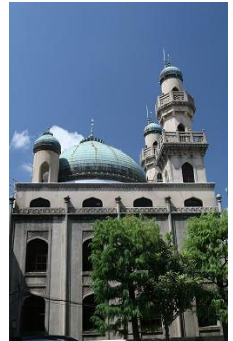
Kobe Muslim Mosque