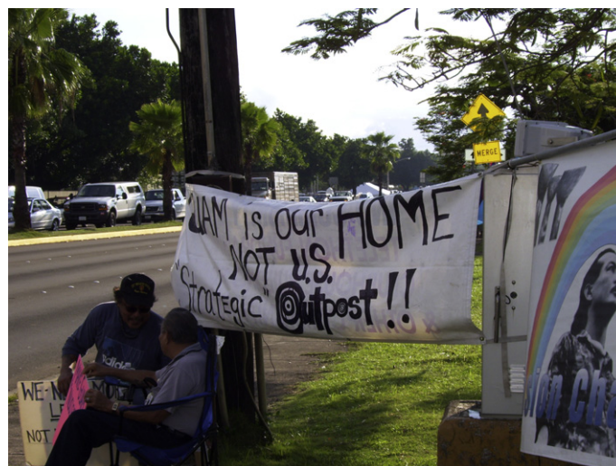
Fig. 3. Protest on Guam.

Residents on Guam, who see that activist successes on Okinawa, Vieques, Hawaiï and elsewhere have shifted the problems of militarization onto their island, are not only trying to block the plans of the DOD through the building of broad local coalitions, but also they are looking for solidarity from groups in other places. They are indeed getting that support through visits by Okinawan activists and others. While activists see this one-to-one form of solidarity as important for sharing tactics, strategies, and support, there has been a realization among activist groups in many parts of the world that victories in a particular locale against a US base have merely resulted in the geographic shifting of the network to other places. This ability of the Pentagon to reorganize their network regionally and globally in response to local and national resistances has caused anti-militarization groups to reformulate the scales that they operate on.